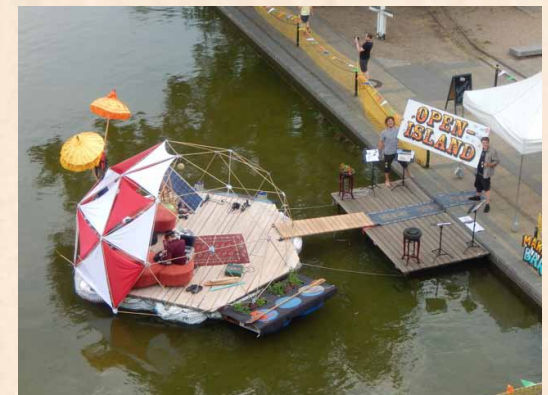
Open-Island module at the MakerFaire Berlin, 2018

An optional second day of the conference could include a design thinking workshop for selected ideas and a kick-off ceremony for the „Maker Week“ to set the wheel of change into motion.