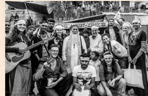
Makers-4-humanity collective, Varanasi 2017

After the temporary Lake of Change project, all partners are free to use the common learnings and open-source designs within their professional context, provided that the intellectual properties of individual design contributors and the creative commons licence of the Open-Island system are assured. Also, all ongoing activities based on the Lake-of-Change project and Open-Island shall be documented on the online platform to build up a sharing community and open-source repository of methods, concepts, manuals and knowledge.