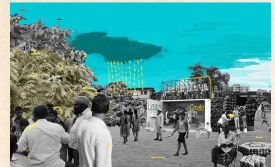
Urban transformation hub, Daravi/Mumbai, 2017

„Lake of Change“ Bangalore, 19.11.-23.12.2018 page 2/6